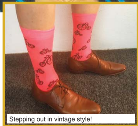
Stepping out in vintage style!