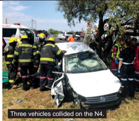
Three vehicles collided on the N4.

Kroondal – At least three people were injured after three vehicles collided on the N4 close to Kroondal, outside Rustenburg, on Friday, 1 December. At approximately 13h30, ER24 paramedics arrived at the scene and found two women, who sustained moderate injuries, trapped in a Polo. They were treated for their wounds and transported to nearby hospitals for further medical care. One man sustained minor injuries in the collision and was treated by other emergency services on scene. Investigations continue.