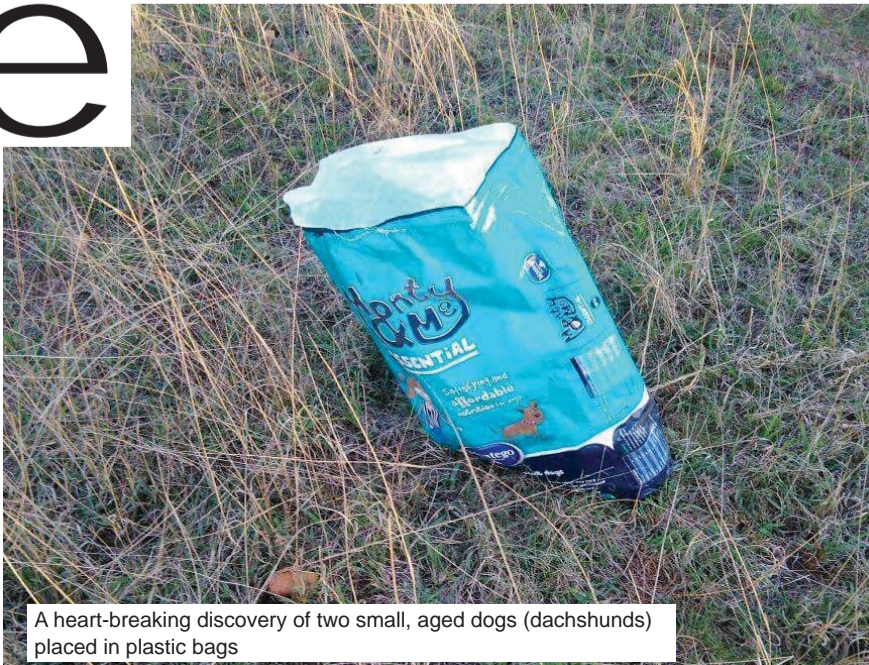
A heart-breaking discovery of two small, aged dogs (dachshunds) placed in plastic bags