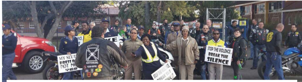
Last Saturday, 10 June 2017, a similar march was held to great success organised by the RLM. The purpose of these marches is to bring awareness, education and dialogue amongst the civil society, business, law enforcement agencies, and NGOs regarding abuse and violence against women and children.