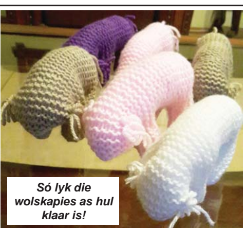
Só lyk die wolskapie as hul klaar is!