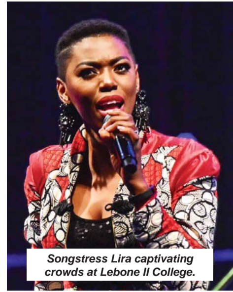
Songstress Lira captivating crowds at Lebone II College.

Lebone II College raised over R200 000 in funds by hosting this concert, which will be added to the Lebone II Scholarship Programme. This programme currently serves 45% of the student body through a range of bursaries and scholarships.