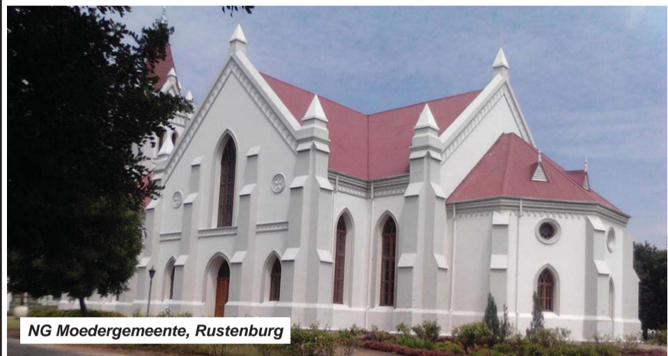
NG Moedergemeente, Rustenburg

Vir meer informasie, kontak die NG Moedergemeente by 014-594 1029 of stuur 'n e-pos aan rtbmoedergemeente@gmail.com.